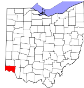
Location of Hamilton County in the State of Ohio