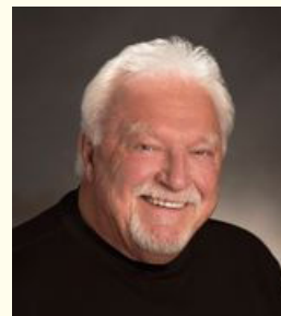
Santa Cruz Homegrown

149 Franklin St. Santa Cruz CA 95060 $1,375,000 755 14th Ave. #705 Santa Cruz CA 95062 $561,000 2050 17th Avenue Santa Cruz CA 95062 $1,436,000 141 Spreading Oak Dr. Scotts Valley CA 95066 $1,910,000 614 Bean Creek Rd. Scotts Valley CA 95066 $735,000 109 Dell Way Scotts Valley CA 95066 $1,185,000 Vacant Land Scotts Valley CA 95066 $20,093,000 650 Tabor Way Scotts Valley CA 95066 $1,100,500 335 Skyforest Way Scotts Valley CA 95066 $1,075,000 40 Willis Road Scotts Valley CA 95076 $1,230,000 217 El Camino Rd. Scotts Valley CA 95066 $1,050,000 551 Lockwood Lane Scotts Valley CA 95066 $1,000,000 1315 Ponza Lane Soquel CA 95073 $2,650,000 360 Hoover Rd. Soquel CA 95073 $825,000 4206 Topsail Ct. Soquel CA 95073 $625,000 620 Lagunita Dr. Soquel CA 95073 $1,400,000 3923 Mainsail Place Soquel CA 95073 $3,200,000 241 Bronco Road Soquel CA 95073 $3,250,000 108 Hastings Lane Watsonville CA 95076 $330,000 101 Shell Dr. #271 Watsonville CA 95076 $1,225,000 442 2nd Street Watsonville CA 95076 $420,000 129 Madison St. Watsonville CA 95076 $871,000 3 La Paz Court Watsonville CA 95076 $700,000 82 Puffin Lane Watsonville CA 95076 $1,888,000 161 Marin St. Watsonville CA 95076 $935,000