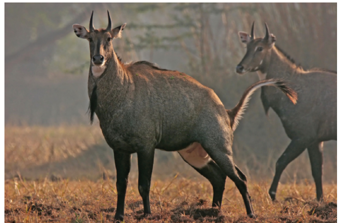
Fig. 1. —Male Boselaphus tragocamelus in characteristic defecation posture (foreground), Koleado National Park, western India, December 2004; note beard below the white gular patch and short, pointed horns, both unique to males.

Antelope tragocamelus Pallas, 1766:5. Type locality unknown; name based on zoo specimen from "Bengal [= northeastern India] from a very remote Part of the Mogul's Dominions" (Parsons 1745:465).