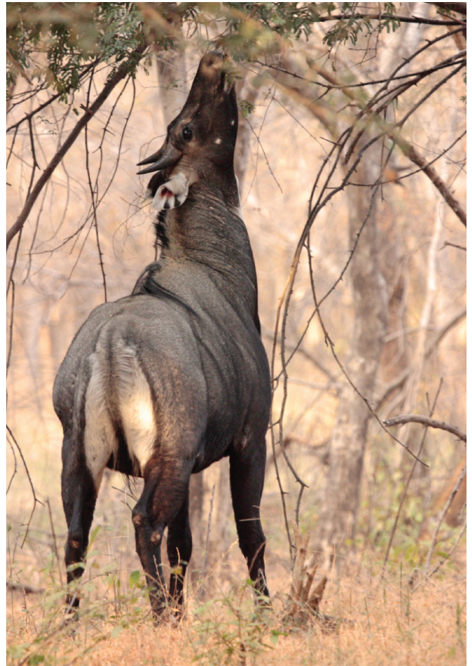
Fig. 5. —Male Boselaphus tragocamelus reaching for leaves of woody vegetation in Ranthambore National Park, Rajasthan, India, December 2004; browse is seasonally important in the diet in India and southern North America; note the characteristic “hogmane” at base of the neck.

Maximum life span is 12–13 years in the wild (Berwick 1974; Mungall 2000; Mungall and Sheffield 1994) and 20–21 years in captivity (Grzimek 1990; Jones 1982); 1 female born at the National Zoo, Washington, D.C., lived 21 years and 8 months (Weigl 2005). Survival patterns among male and female B. tragocamelus are similar to those of other ungulates (Brown 1976) but vary depending on population density and status of particular populations, either on native or introduced range (cf. Berwick 1974; Sheffield et al. 1983). High rates of mortality are common for males in particular, but also females, before age 3 (Berwick 1974; Brown 1976). In Gir Forest, India, 34% of calves die each year, and there is a general linear decline of 52% of 2–10-year-olds of both sexes (Berwick 1974). In southern Texas, mortality of both