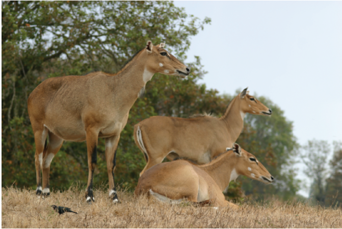
Fig. 2. —Three tawny-colored female Boselaphus tragocamelus in a game park in Roseburg, Oregon, United States; note the characteristic white cheek spots and the 2 white rings above the fetlocks, which led to the early common name, white-footed antelope.

74.7 of the International Code of Zoological Nomenclature (International Commission on Zoological Nomenclature 1999:83; K. Helgen, Smithsonian Institution, pers. comm.), such a designation cannot be made after 1999 without meeting 3 criteria, including “an express statement of the taxonomic purpose of the designation” (Article 74.7.3). I found no reference to such a purpose in Grubb (2005:693) and concluded that this designation is not valid under the current Code .